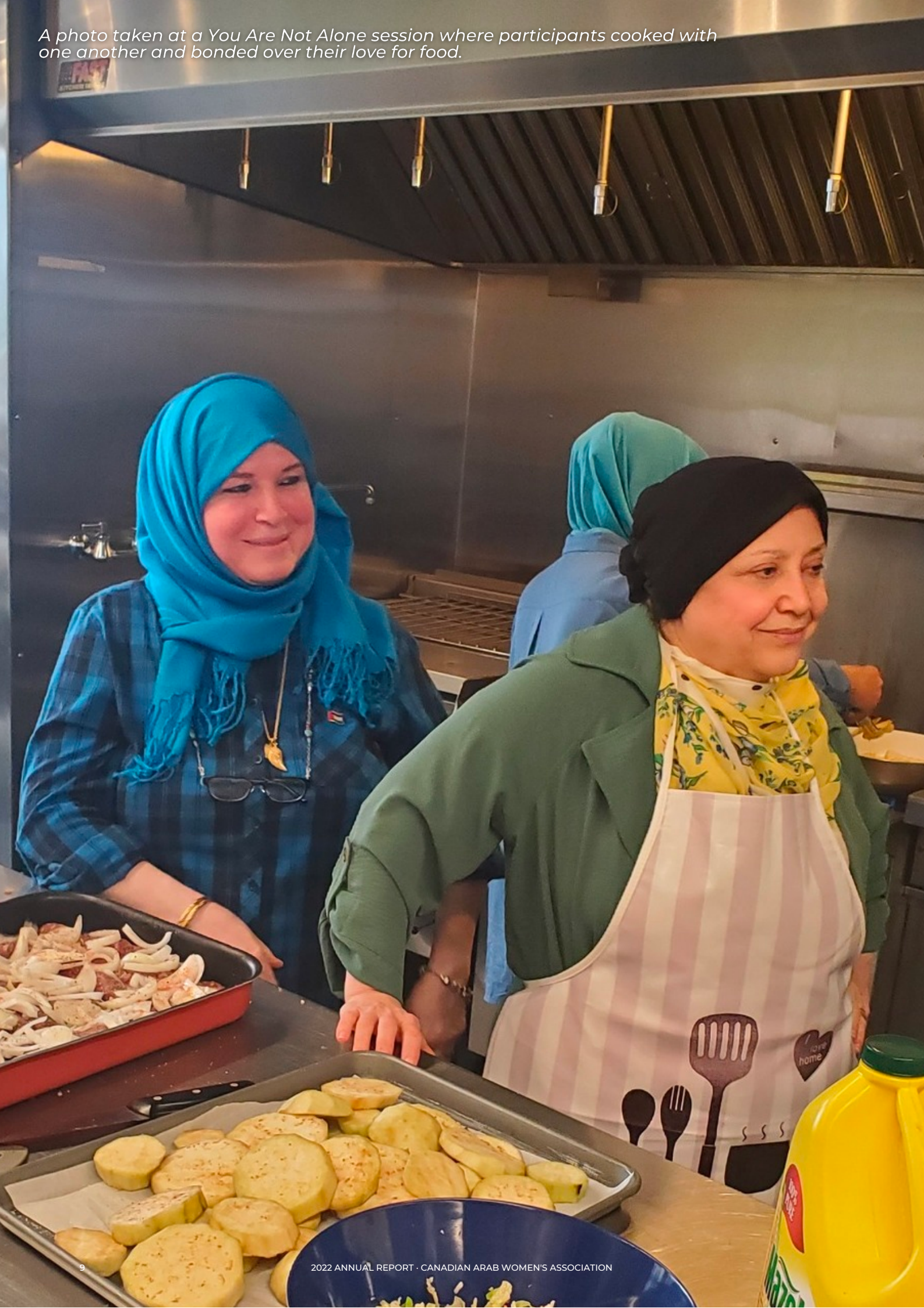
A photo taken at a You Are Not Alone session where participants cooked with one another and bonded over their love for food.