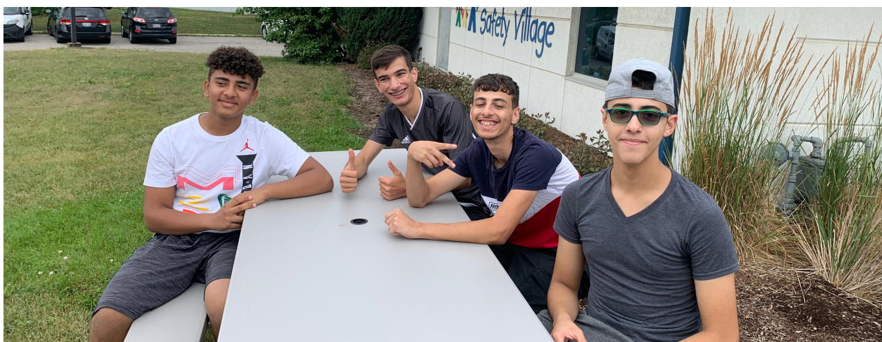
Yalla Shabab Go! participants during an outdoor excursion.

In partnership with the Guelph Police Service , Yalla Shabab Go! , was designed to foster mutual understanding and trust with the Police as well to equip Arab boys with the knowledge they need to maintain their safety and that of their loved ones. Participants engaged in facilitated and interactive discussions, played in team sports with the police, and formed connections that will undoubtedly persist for years to come.