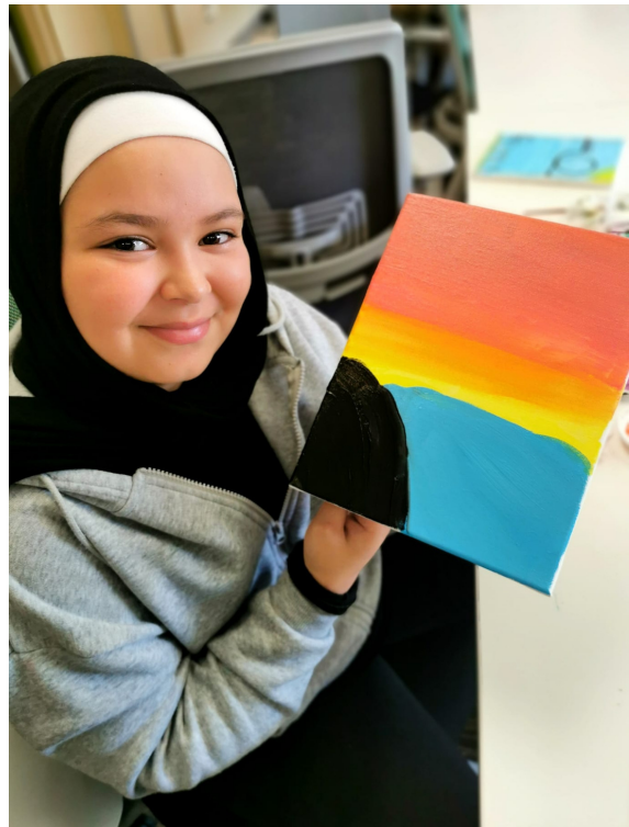
Girls' Zone participants presenting the artwork they created during a program session.

Girls' Zone was a program focused largely on fostering leadership and developing skills, such as independence and advocacy. These young participants had the opportunity to explore careers in fields where women, particularly Arab women, are underrepresented, such as science, math, engineering, and technology. Additionally, physical activity in sports was promoted as a tool to help build confidence in areas which are typically male-dominated.