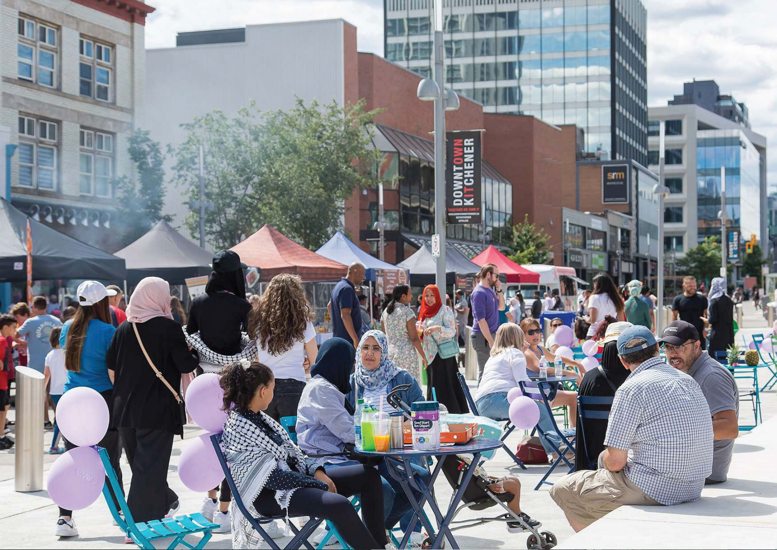
Photos taken during the Middle Eastern Festival.