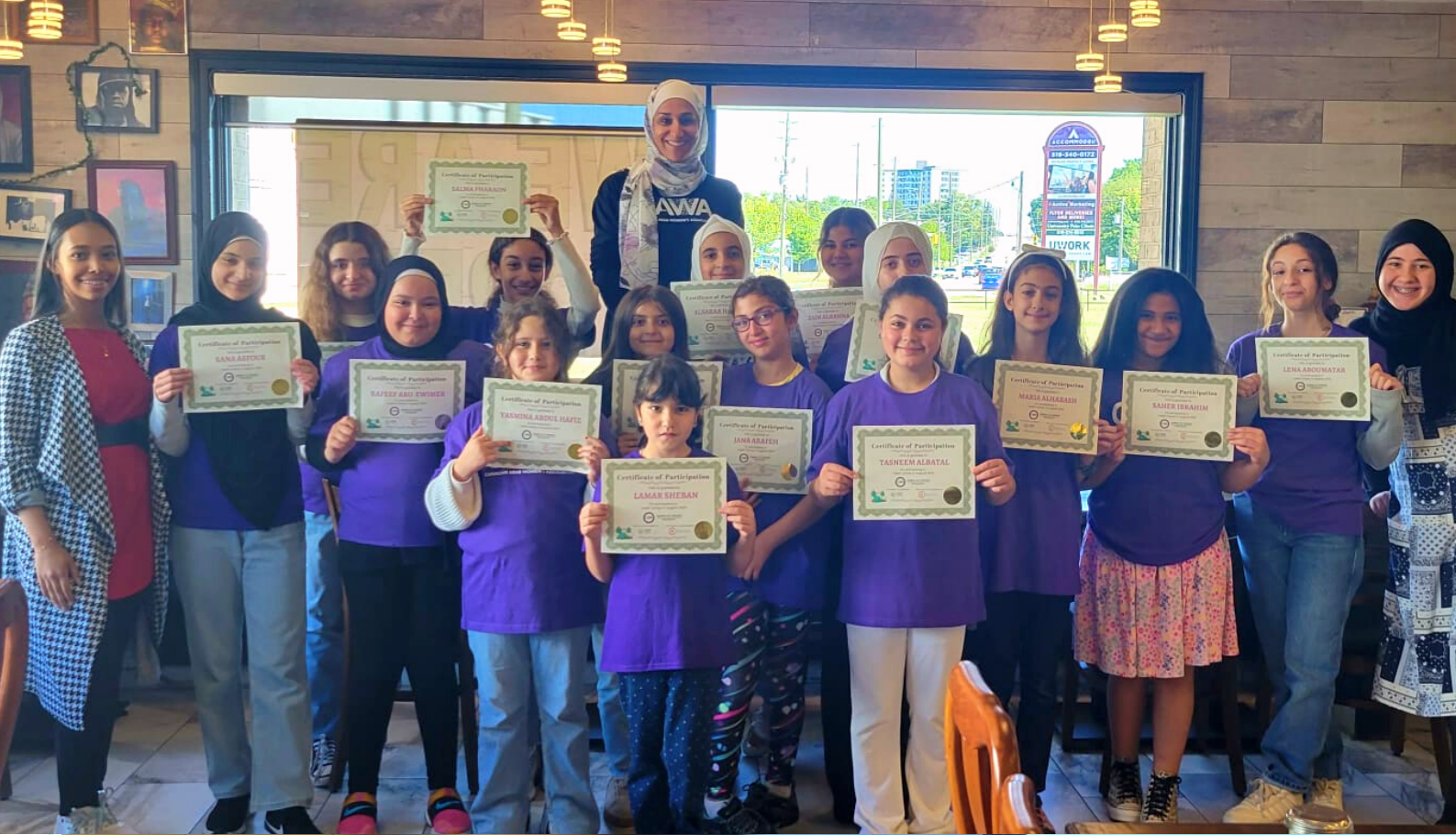
Photos from the Girls' Zone graduation hosted in September 2022.