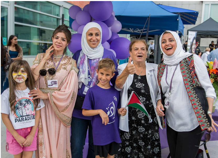
CAWA staff and their family members during the Middle Eastern festival.

As well as serving the members of the Arab community, CAWA strives to educate the broader community about Arab culture and celebrate with people from all backgrounds and walks of life.