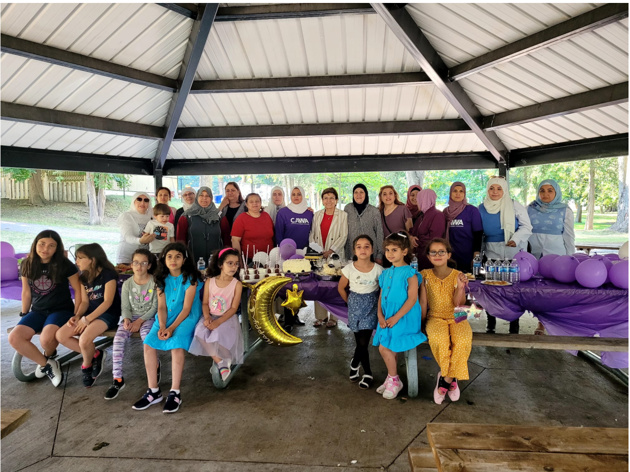
Attendees at a Strong Families Together event.

This program is funded by the Canadian Women's Foundation and is delivered in partnership with Women's Crisis Services of Waterloo Region , who work with CAWA to connect newcomers to local resources that they can turn to in times of need.