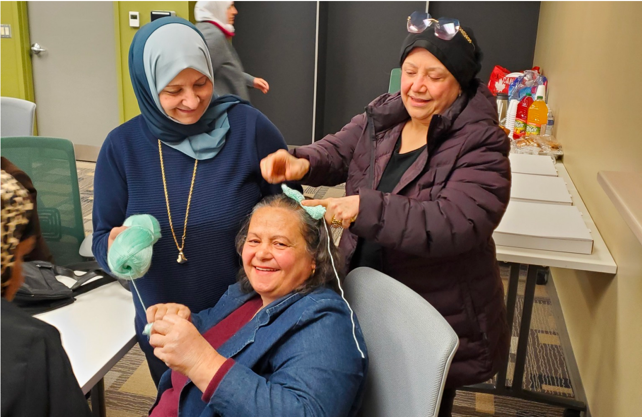
Participants at a You Are Not Alone session about knitting.