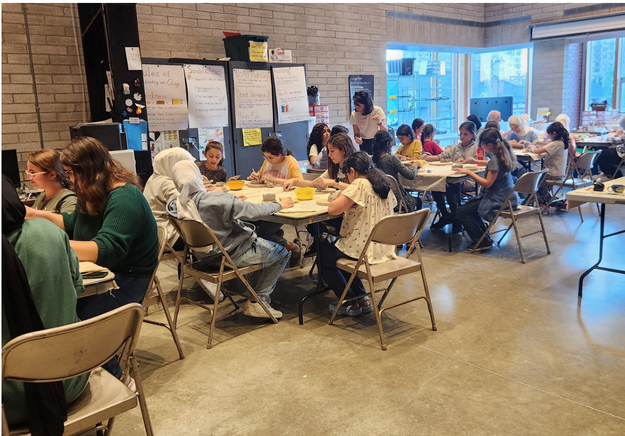
Girls' Zone participants presenting the artwork they created during a program session.

The core of CAWA's goal is to empower and invest in the future of Arab women of all ages. For Arab girls, we were pleased to provide the Girls' Zone program; it was created with multiple goals in mind, one of which is for participants to develop leadership abilities and vital abilities like advocacy and independence. Throughout the course of the program, participants were urged to consider careers in STEM fields—science, technology, engineering, and mathematics—which are generally underrepresented by women, particularly Arab women. Furthermore, we advocated for sports and physical exercise as empowering means of enhancing self-esteem in fields that are traditionally dominated by men. Girls' Zone had a significant impact on Arab girls in the Waterloo Region and Guelph, empowering them and opening up their horizons to possibilities and viewpoints that some of them had never considered through a wide variety of interesting and age-appropriate activities. Every activity, from Robotics and Coding to leadership development sessions, from art workshops to traditional Arab dance (Dabkeh), was thoughtfully chosen to uplift, inform, and empower participants.