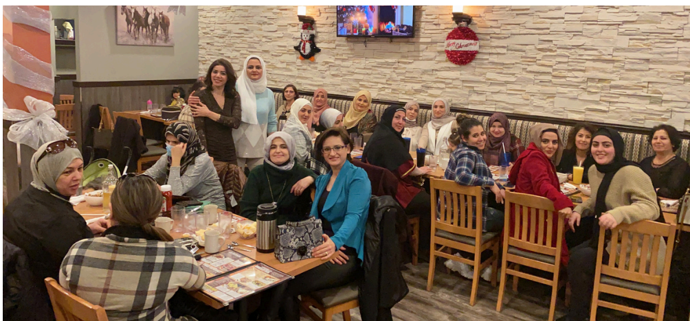
photo taken at a Bloom with CAWA gathering.

Furthermore, sessions addressing domestic violence have given women access to essential resources and support systems, which have helped them feel safe and empowered. The program's dedication to supporting Arab women in Canadian culture is constant, even as it develops further. It aims to offer a variety of experiences that meet their educational, psychological, and intellectual needs so they can better themselves and their families in the future.