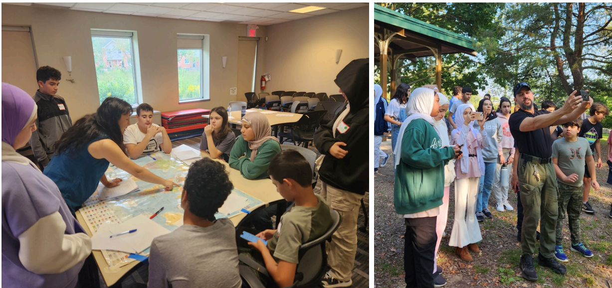
Yallah Shabab Go! participants during an educational session and a photography.

This inclusive approach not only promotes social interactions but also cultivates a sense of belonging and empowerment among youth. Yallah Shabab! embodies our dedication to the holistic well-being of Arab families, ensuring that every member has the opportunity to thrive, connect, and positively contribute to our community.