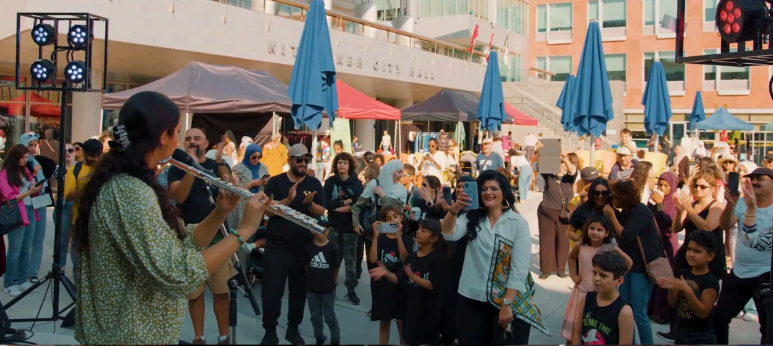
Photos taken during the Middle Eastern Festival.