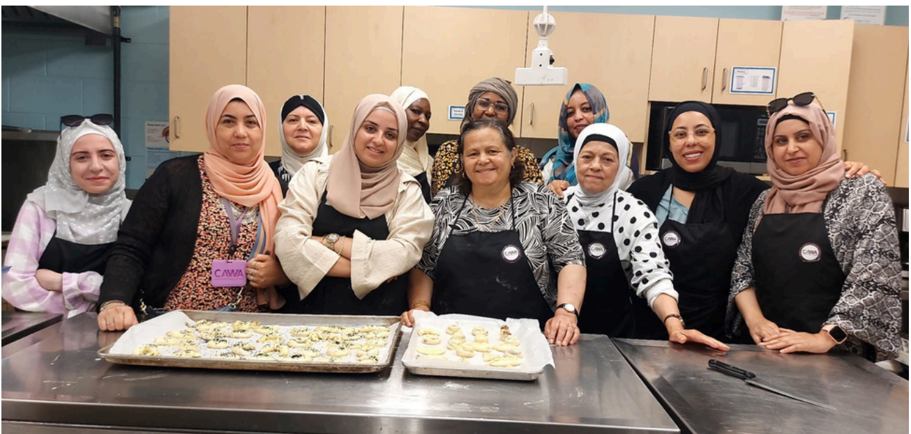
Photo of the Guelph Community Kitchen participants.

The impact of the Guelph Community Kitchen initiative extended beyond training. Some women are actively applying their skills in a second component, participating in the CAWA catering program. The catering service menu, featuring dishes learned during training, not only empowers participants to contribute to the culinary landscape but also fosters entrepreneurial skills. Additionally, the Cooking Class initiative, led by program graduates, serves as another dimension, showcasing the transferability of skills as participants learn popular Arab appetizers. Overall, this project not only enriches knowledge but also provides practical pathways for economic empowerment, enabling women to apply their culinary skills and potentially establish their own successful businesses in Guelph.