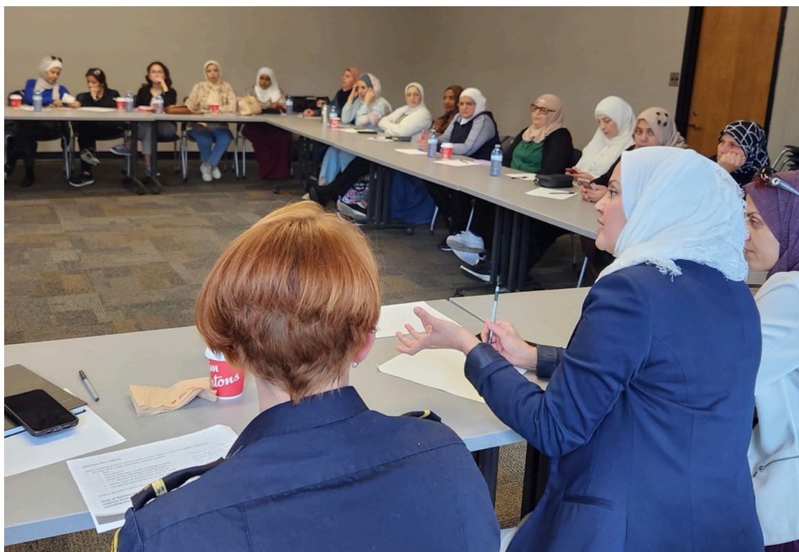
CAWA hosted a small food business regulations seminar at the Waterloo Public Library.

Our goal is to empower Arab women to express themselves confidently in English, enabling them to navigate daily interactions and pursue further educational opportunities in their new environment. By fostering a supportive and inclusive learning environment, CAWA aims to equip participants with the language skills they need to thrive in Canadian society.