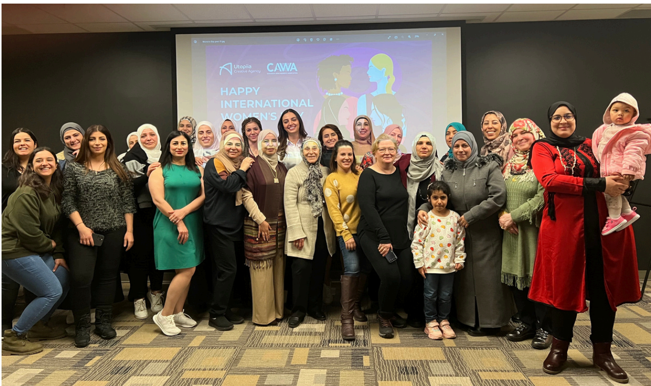
Group photo taken at a social media training session.

In conclusion, the Canadian Arab Women's Association is not just facilitating integration; it's shaping a future where every newcomer, especially women, thrives and contributes meaningfully to the Canadian mosaic. Their targeted support and community-building efforts are key drivers in creating a more inclusive and empowered society.