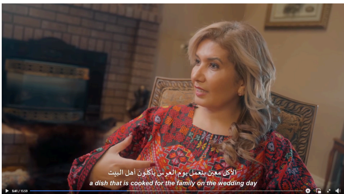
Screenshot from the "Tell Me About Your Country" documentary.

"Tell Me About Your Country" amplifies marginalized voices and promotes a greater understanding and celebration of cultural diversity. It embodies the transformative power of storytelling in fostering inclusive communities. This documentary stands as a testament to CAWA's unwavering dedication to celebrating diversity and fostering cross-cultural dialogue, leaving a profound impact on audiences and enriching the collective tapestry of Canadian identity.