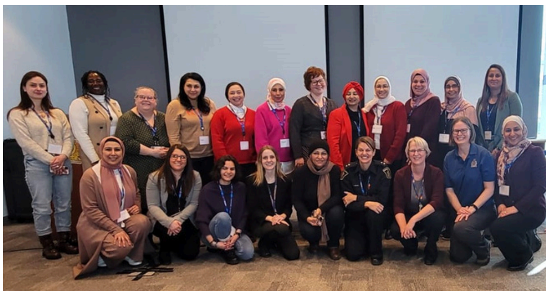
Staff and Participants at the WRPS mentorship workshop.

Program participants and alumni actively engage in the Job Finding Club, leveraging it as a valuable platform for sharing insights, job leads, and practical advice. Within this community, members collaborate to offer support and guidance to one another, enhancing their collective efforts in navigating the job market. It serves as a dynamic space where individuals exchange tips, discuss employment opportunities, and provide valuable mentorship to empower each other in their professional journeys. We are always so proud of our participants, as we move forward to celebrate the accomplishments of our program's graduates in a ceremony, our partner Dress for Success Toronto provides each graduate with a proper work attire.