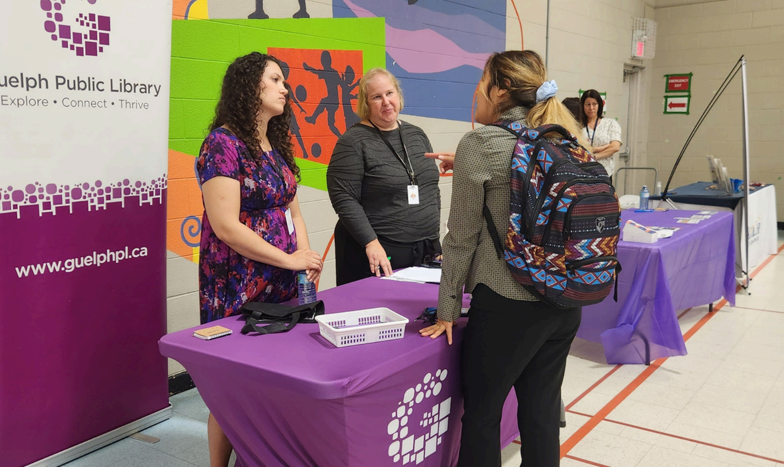
Photos taken during the KW and Guelph Job Fair.