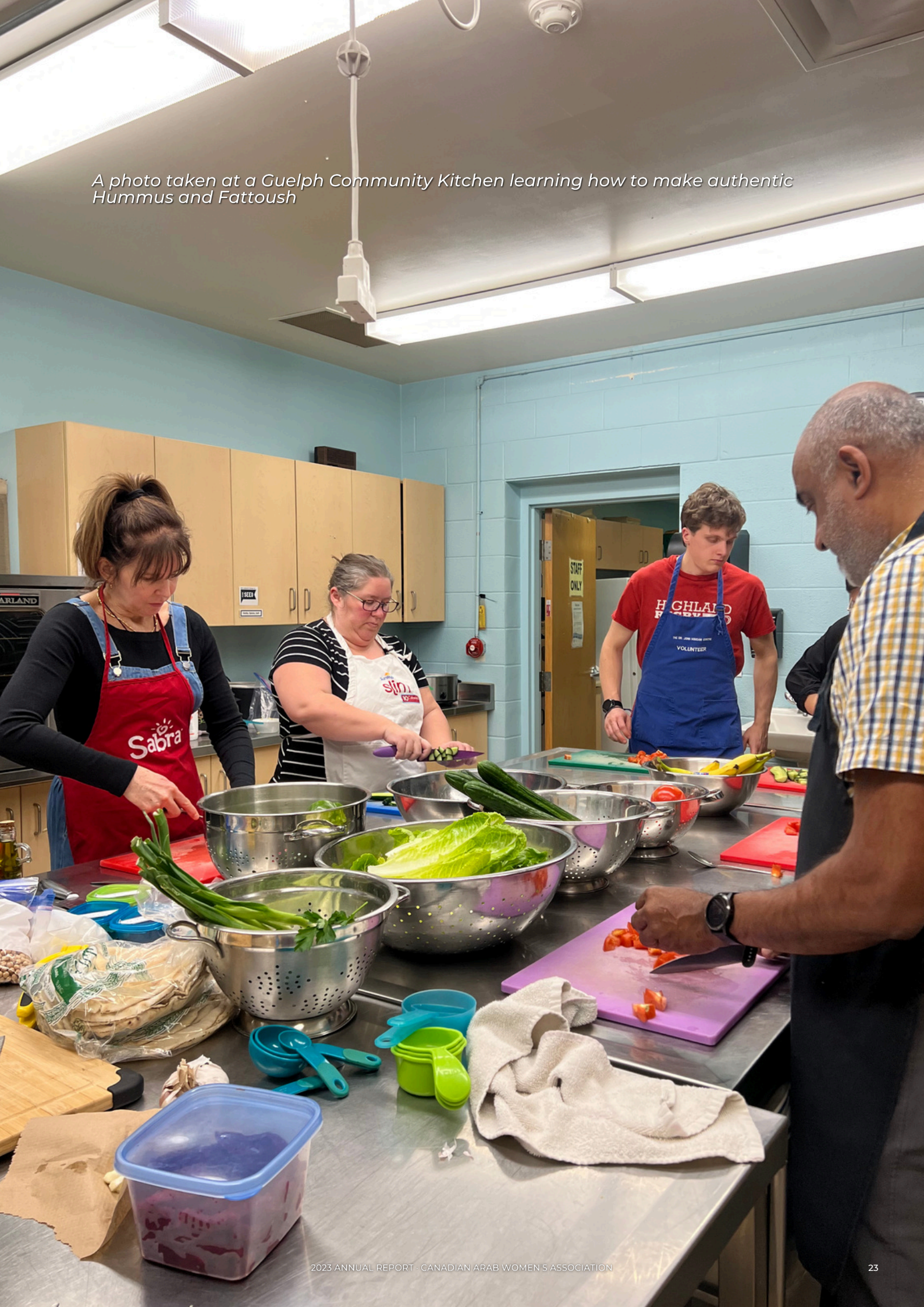
A photo taken at a Guelph Community Kitchen learning how to make authentic Hummus and Fattoush