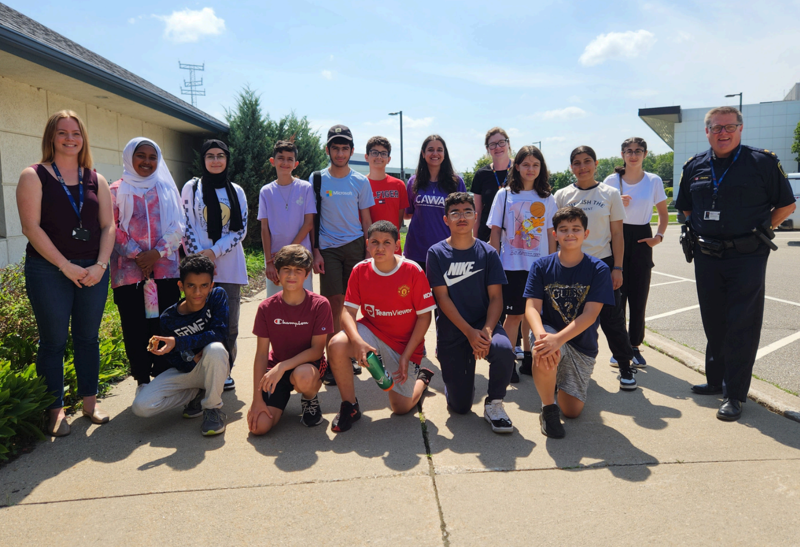
Celebrating the 2023 Girls' Zone completion hosted at Arabesque.