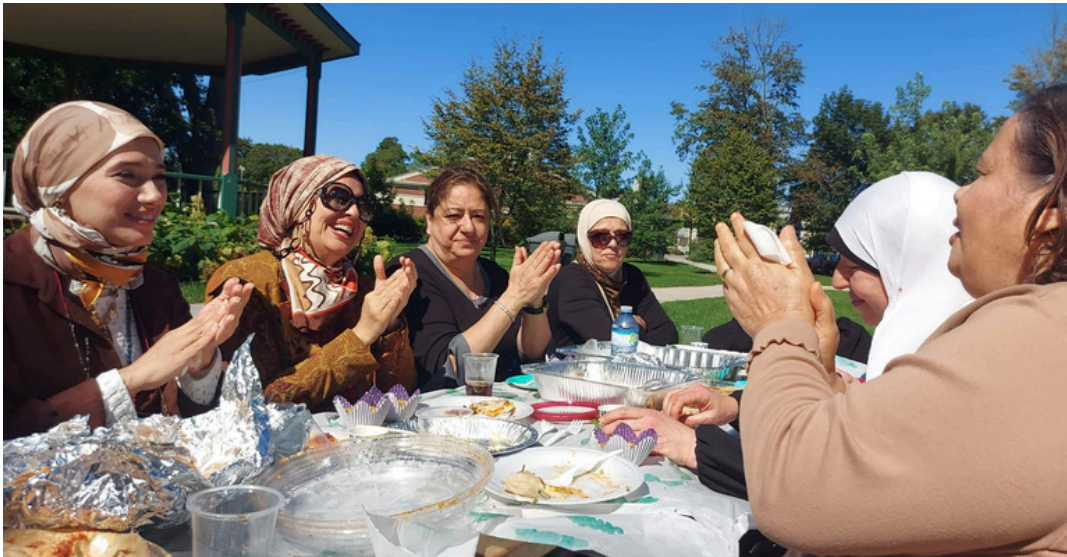
A "You Are Not Alone" get together at Waterloo Park.

Experience the transformative power of "You Are Not Alone for Seniors" at CAWA, an inclusive program dedicated to promoting social participation among senior women within the Arab community. Through engaging sessions that include creative work and social activities, our program has proven to be a beacon of positive change for participants. By fostering a sense of community and providing a platform for meaningful connections, we witness the profound impact on mental well-being and social bonds among our senior participants. It has created an environment where shared experiences and social gatherings replace virtual counseling sessions, becoming a turning point in the lives of those seeking connection and support. "You Are Not Alone for Seniors" is not just a program; it's a catalyst for positive transformations and a testament to the healing power of community bonds.